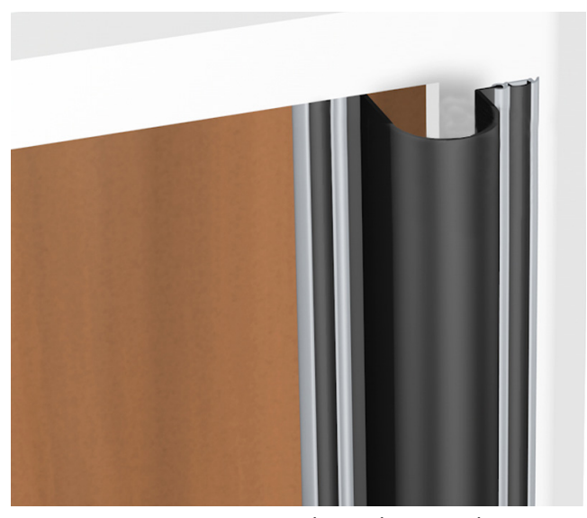
FingerKeeper Industrial - RP62 shown on a closed door