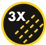
TRIPLE STITCHED SEAMS