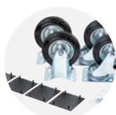
Castor Kit CASS1