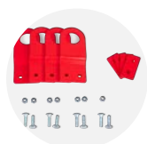
Crane lifting eyes CLEK (500kg capacity when fitted)