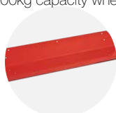
TuffBank Shelf SHE-4